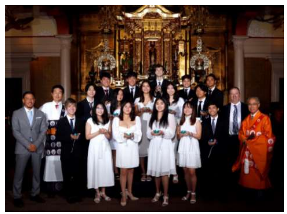
Pacific Buddhist Academy Class of 2023